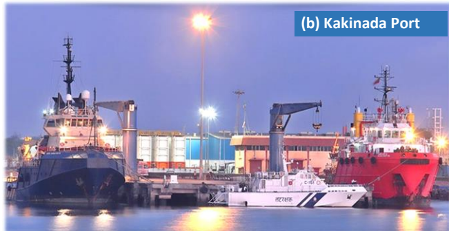
(b) Kakinada Port